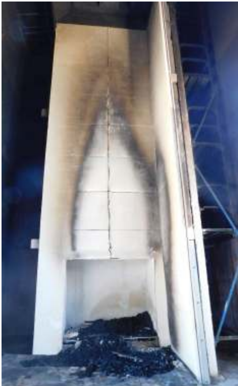
QT Conpolcrete TCS Render