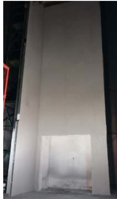
Magnesium Board Rockcote Quickntuff

The proposed Rockcote render system evaluated for the QT Conpolcrete wall system is that which has been applied to the Magnesium board installation. The conditions of the wall post test is detailed below.