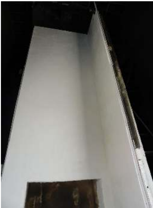
QT Conpolcrete TCS Render