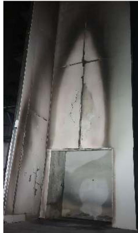
Magnesium Board Rockcote Quickntuff

Both render systems did not contribute to the spread of fire. In addition, the base wall system being the QT Conpolcrete as well as the magnesium board were sustained during the fire test particularly after being exposed over the construction joints.